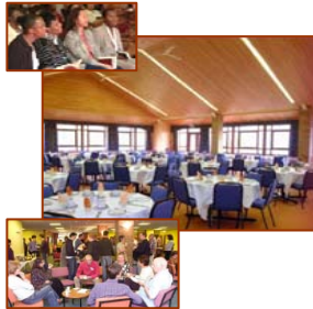
King's Park Conference Centre

Time spent in these studies is greatly rewarded and if you are new to them, help will be on hand to ensure you gain the most from your time. Those who would like to know more about inductive Bible study can join in a seminar during the week.